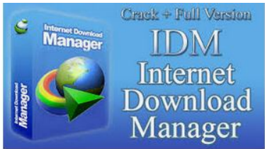
Internet Download Manager IDM 6.29 ... youtube.com